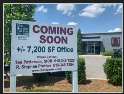
LEASING AVAILABLE NOW!