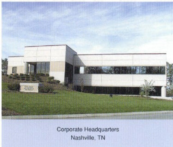
Corporate Headquarters Nashville, TN

With experienced architects on staff, Frierson excels at design/build, the most efficient and cost-effective construction strategy available today. This is evidenced by the fact that almost 50 percent of today's private construction is delivered via this technique. For each project, Frierson assembles its team of experts who specialize in the type of facility the client needs. Whether the facility is industrial, distribution, commercial or institutional in nature, Frierson's team can seamlessly coordinate design and construction to eliminate unnecessary delays as they maximize value.